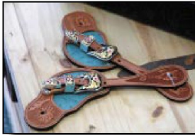
▲ Spir Straps and Closeup of boot