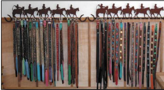
▼ Handmade Belts